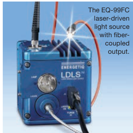
The EQ-99FC laser-driven light source with fiber-coupled output.