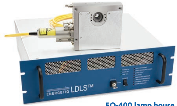
EQ-400 lamp house with power supply