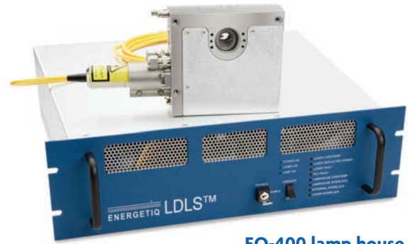
EQ-400 lamp house with power supply